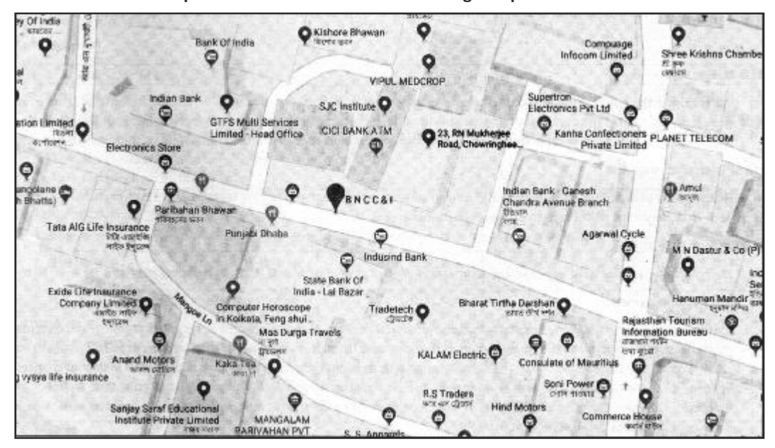
41A, AJC Bose Road 505, Diamond Prestige, Kolkata – 700 017